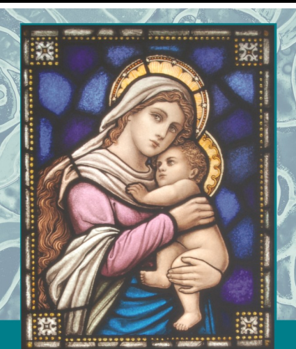
Mary, the Holy Mother of God

Contribution Envelopes are available in the Parish Offices. If you did not pick them up in the back of church, please stop by the offices. If there is an issue with your envelopes, please call the Offices at 963-4205.