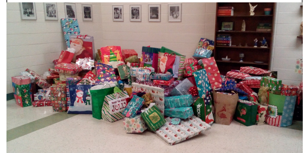
We are grateful for the support of all of our neighbors in helping those in need.